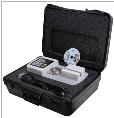
WT3004-1 Carrying case

Provides storage space for the WT3-201M tester, optional ring terminal fixture, power cord, USB cable, and accessories.