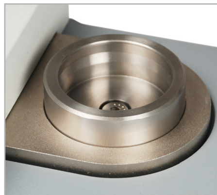
WT3003 Machinable blank terminal fixture

Secures ring terminations. Pin diameters from 1/8 to 3/8 in [3.2 to 9.5 mm].