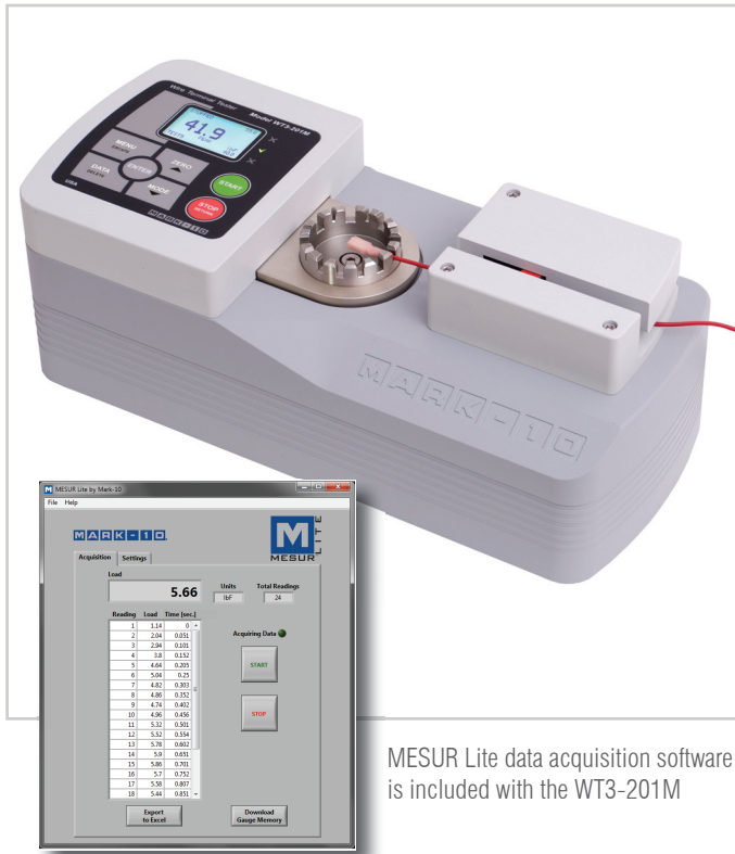
MESUR Lite data acquisition software is included with the WT3-201M

The WT3-201M motorized wire crimp pull tester is designed to measure pull-off forces of up to 200 lbF [1 kN] for wire and tube terminations. The tester conforms to numerous UL, ISO, ASTM, SAE, MIL, and other requirements for destructive testing. Non-destructive testing is also possible, such as pulling to a load or maintaining a load for a specified period of time, as per the requirements of UL 486A/B. Programmable pass/fail limits with red and green indicators and audio alerts help identify non-conforming samples.