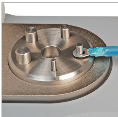
WT3002 Ring terminal fixture

Secures ring terminations. Pin diameters from 1/8 to 3/8 in [3.2 to 9.5 mm].