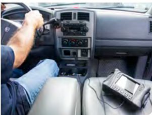
Convenient USB charging system for on the go inspectors