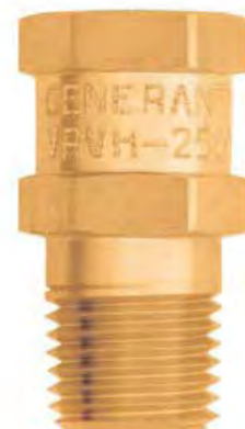
VRVH Vent to Atmosphere