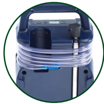
Mast and sampling tube are fitted to the pump, during use and transportation