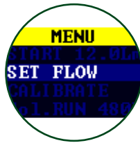
Intuitive menu navigation