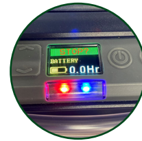
OLED full colour display with Red/ Blue LED's to indicate pump status, visible from a distance