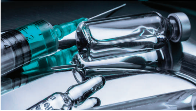
Vaccine & Pharmaceuticals