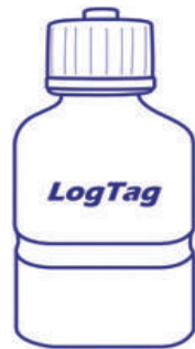
Buffer Assembly Not Included (Silica sand recommended for temperatures below -40°C)