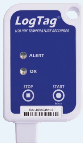
Rated Absolute Accuracy