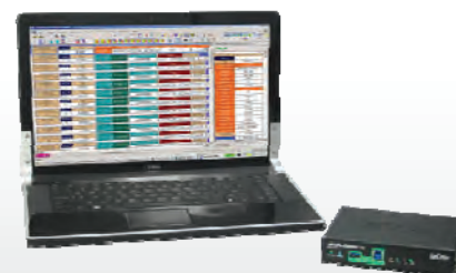
Compact size of Advisor T3 allows for easy portability