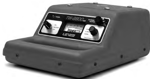
The TW-8800 Transmitter.

WARNING: Do not connect output leads to a live (energized) utility. Please prevent shock hazard and equipment damage.