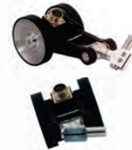
Double Wheel Pivot

An integrated heavy duty encoder and spring loaded measuring wheel assembly all in one, easy-to-use, compact unit. Available in a single, or optional dual-wheel format, the TR3 Heavy Duty Tru-Trac™ is a versatile solution for tracking velocity, position or distance over a wide variety of surfaces in almost any industrial application.