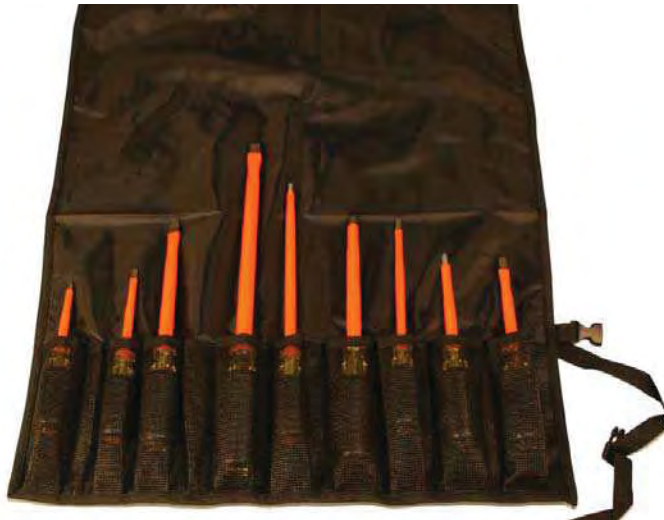
Image for illustrative purposes only— TR-9SD screwdriver roll pictured.