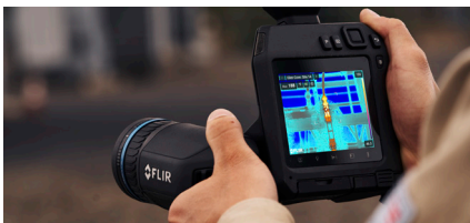
Collect and manage critical data quickly and easily