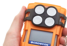
External filter plate