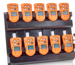
10 way charger