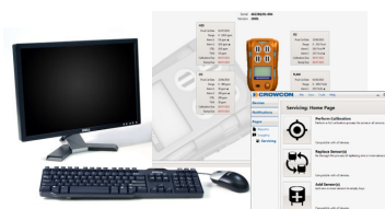
NEW Portables Pro 2.0 Software

Effective charging and storage while travelling