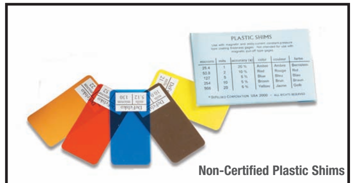
Non-Certified Plastic Shims

A package of 5 non-certified shims is included with all DeFelsko electronic coating thickness gages (Type 2).