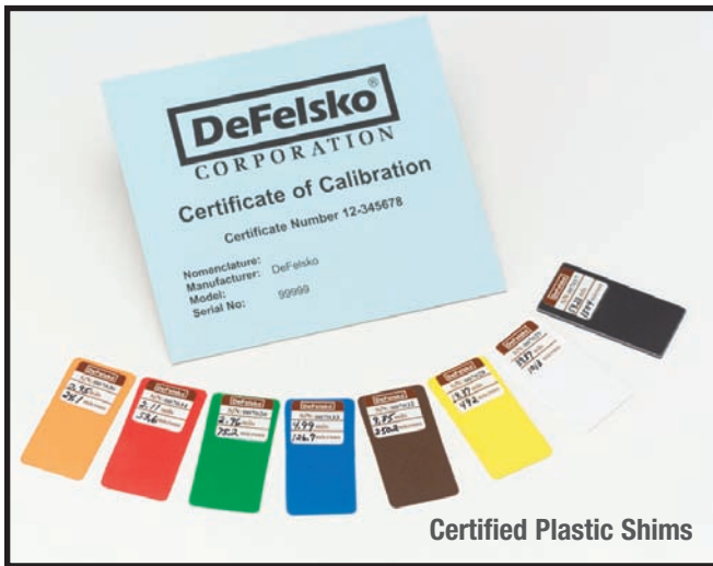
Certified Plastic Shims