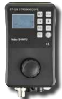
ST-329 Operation Control Enclosure