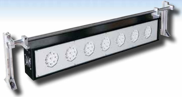
ST-329BL-4 LED Array shown with Optional Mounting Kit

The ST-329BL is designed for speed and frequency measurements in the printing, packaging, textile, automotive, cable, medical industries in various applications.