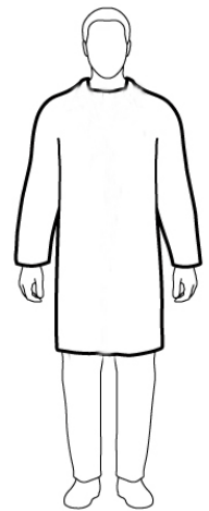
Models SEC857 - SEC859 Smocks, white, attached ties. Sizes: Medium to 2X-Large Case Qty: 50