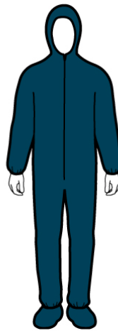
Models SEC847 - SEC852 Coveralls, navy, zipper front with storm flap, attached hood, elastic wrist and ankles. Sizes: Medium to 4X-Large Case Qty: 25