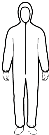
Models SEC841 - SEC846 Coveralls, white, zipper front with storm flap, attached hood, elastic wrist and ankles. Sizes: Medium to 4X-Large Case Qty: 25