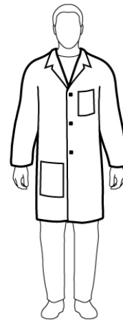
Models SEC853 - SEC856 Lab coats, white, plastic snaps, two pockets and collar. Sizes: Medium to 2X-Large Case Qty: 30