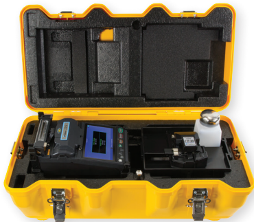
Workstation in Transit Case