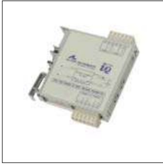
Q501-1xxx (1 channel out) Q501-2xxx (2 channel out)