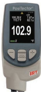
Scanning Statistics Mode