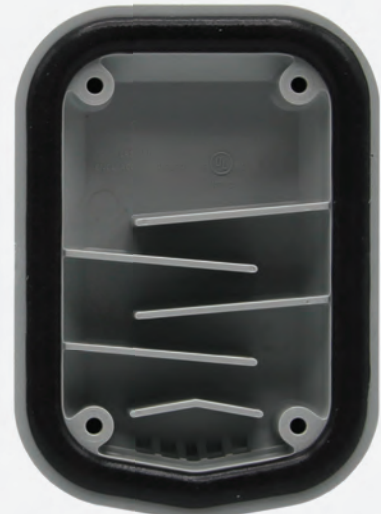
PDA0007 Vent Back