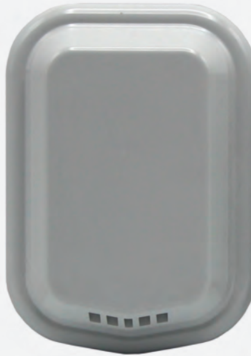
PDA0007 Vent Front