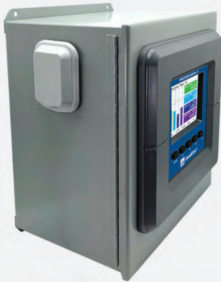
PDA0007 Vent Installed on PDA2929 Enclosure with PD9000 ConsoliDator+ (PDA2929 and PD9000 sold separately)