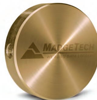
MicroDisc Surface Temperature Probe Attachment