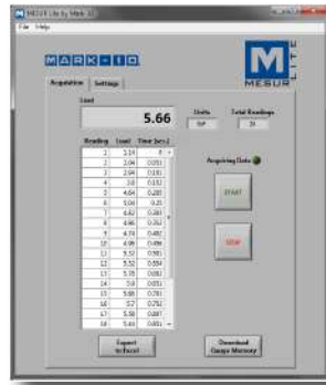
MESUR® Lite data acquisition software is included with Series 7 gauges

Series 7 gauges include all the functions of Series 5 gauges, with several additional features, including high speed continuous data capture and storage, with memory for up to 5,000 readings at an acquisition rate of up to 14,000 Hz. The gauges also feature programmable footswitch sequencing, break detection, and 1st / 2nd peak detection. Series 7 includes a coefficient of friction unit of measurement and user-defined unit of measurement. For productivity enhancement, the gauges also feature automatic data output, data storage, and zero functions upon the completion of break detection, averaging, external trigger, and 1st / 2nd peak detection.