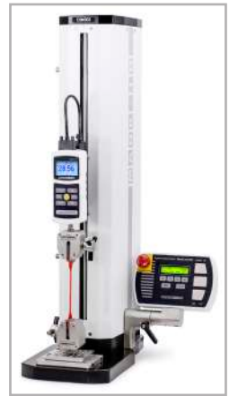
Shown with an ESM303 test stand and G1061 wedge grips

Series 7 force gauges are directly compatible with Mark-10 motorized test stands, to permit functions such as break testing, tensile testing, compression testing, dynamic load holding, PC control capability, and many other applications.