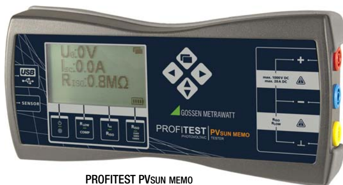
PROFITEST PVSUN MEMO