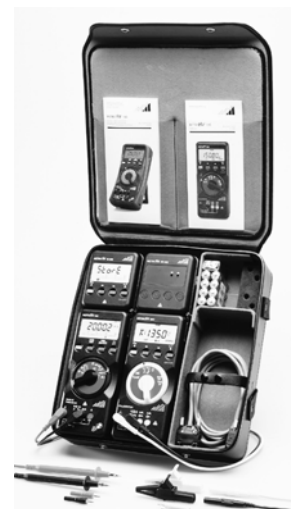
F840 (with sample contents)