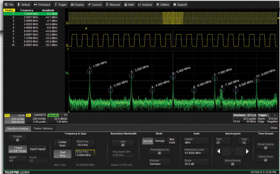
Spectrum analyzer style controls simplify waveform analysis in the frequency domain