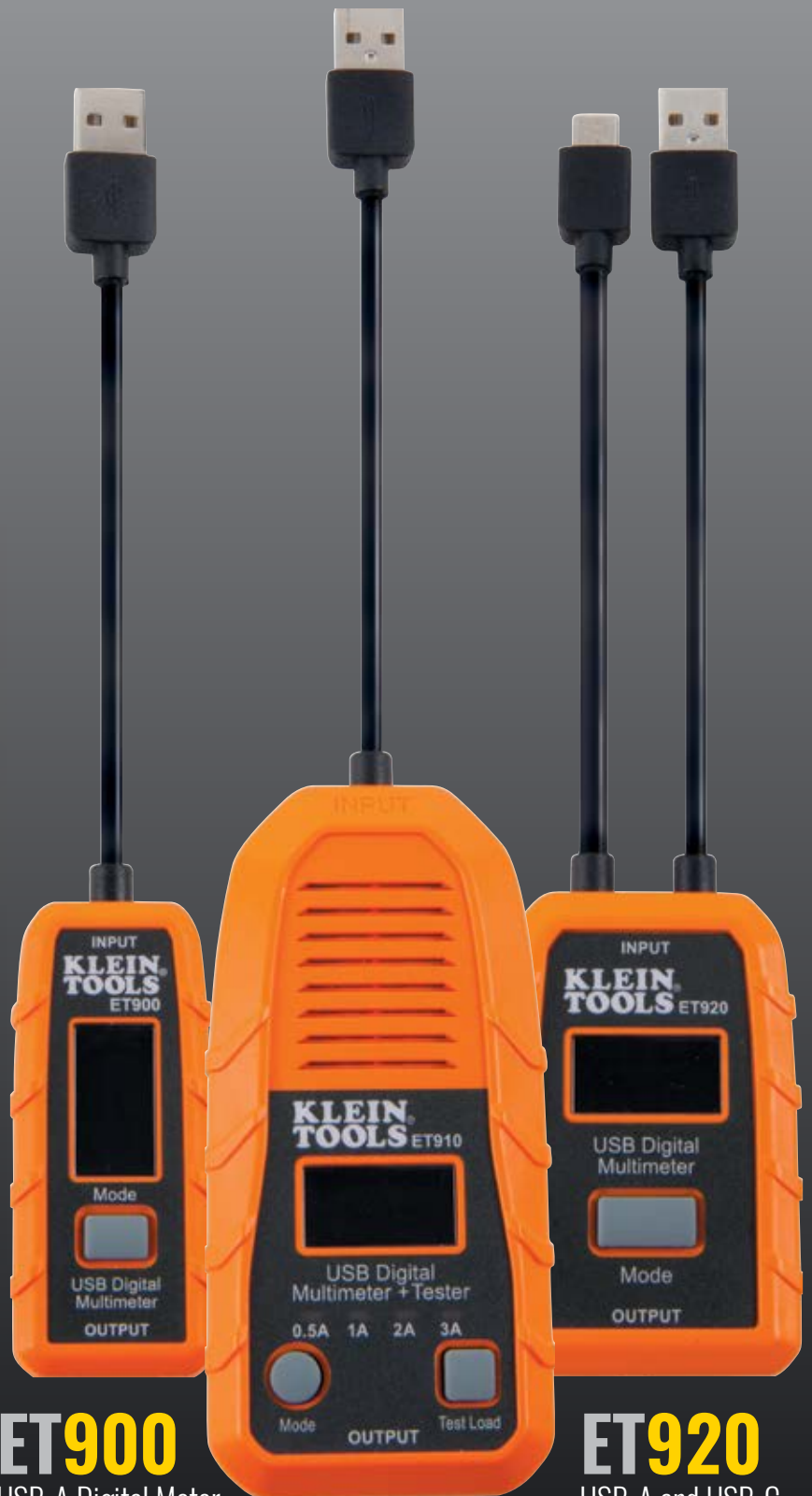
ET900 USB-A Digital Meter