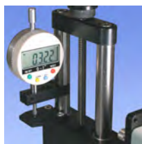
Digital travel indicator