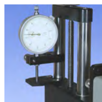
Dial travel indicator