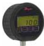
DPG-100 with Protective Rubber Boot