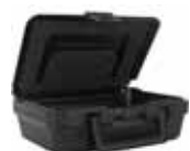
Protective Carrying Case