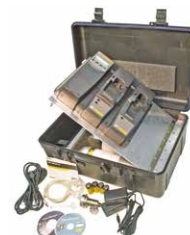
MicroDock II portable system kit