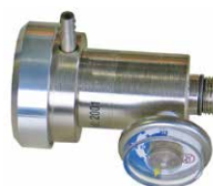
Demand flow regulator