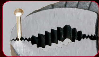
Nail Holding Groove