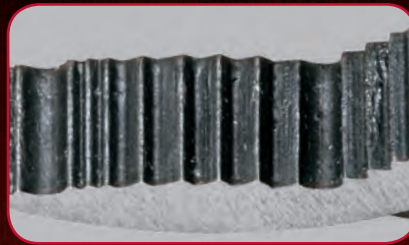
More Gripping Teeth