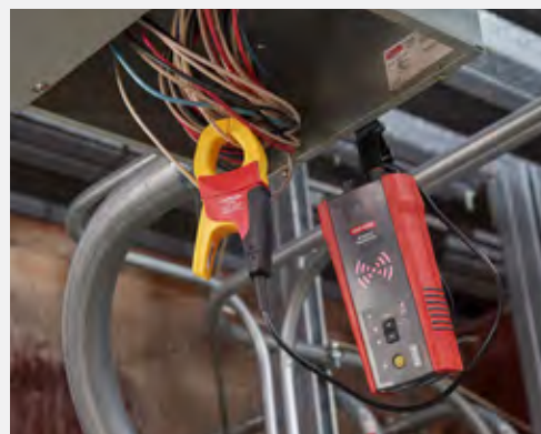
Intuitive transmitter automatically senses whether the system is energized or de-energized