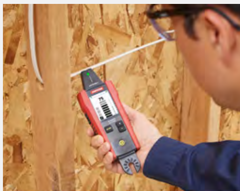
Most accurate wire tracing in its class with eight sensitivity modes