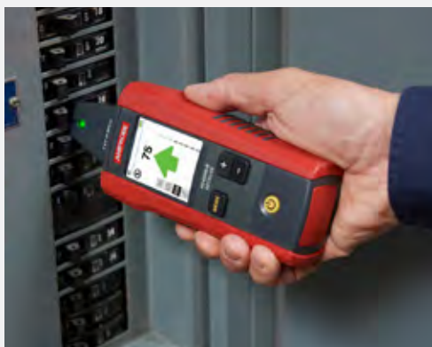
Reduce downtime with immediate and unambiguous breaker identification