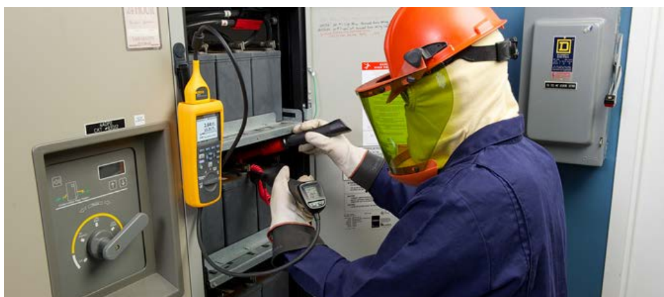
Using the Fluke BT52X to measure impedance, for the quarterly cell/unit internal ohmic value test.