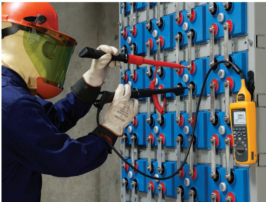
Measuring ohmic values in sequence mode

AC ripple current: residual ac on the rectified voltage in dc charging and inverter circuits.