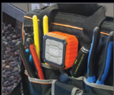
Twist-lock flange on back mounts to Klein's Lighted Tool Bag, Cat. No. 55431