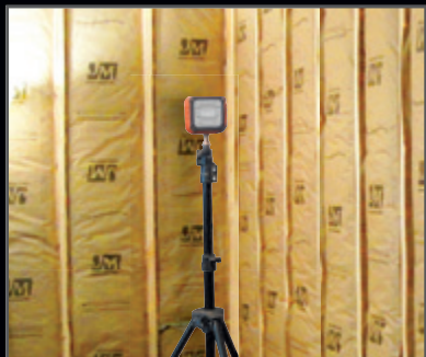
1/4-20 threaded mount on bottom allows attachment to any standard tripod