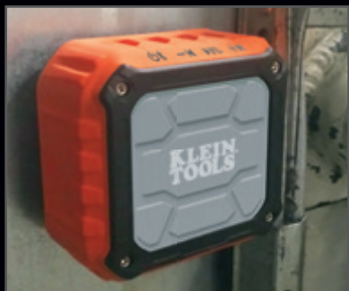
Powerful rear magnet holds speaker securely to metal surfaces