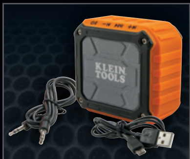
Includes 1/8" (3.5 mm) stereo auxiliary cable and micro USB-to-standard USB charging cable