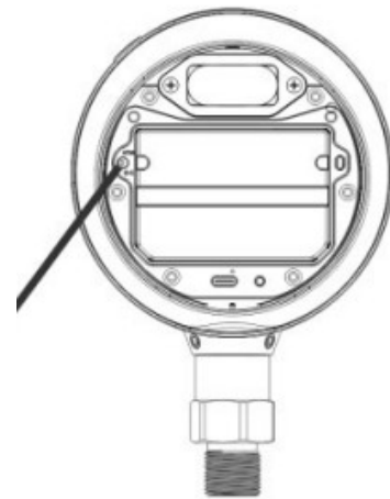
Diagram 5.2 (6 – BP inlet port)