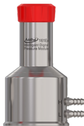
"ADT161Ex pressure modules - See ADT161 Datasheet for more info"

[1] For custom RTD cable lengths over 100 feet (30 meters), which will adhere to Class B, please contact Additel.