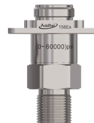
"ADT158Ex pressure module - for use with ADT260Ex (bottom mount)"