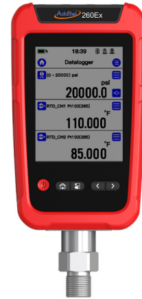
Additel 260Ex with ADT158Ex module