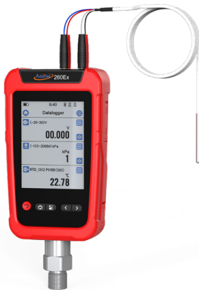
ADT260Ex with AM1602 temperature probe

Note: The ADT260Ex can be purchased without the ADT158Ex module. If needed using the following part number: ADT260EX-NO