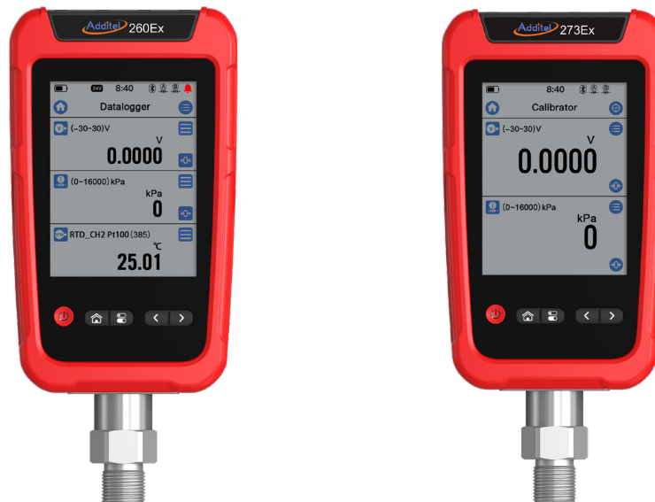
Additel 273Ex and 260Ex with ADT158 pressure module installed