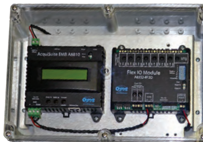
Acquisuite EMB (A8810)