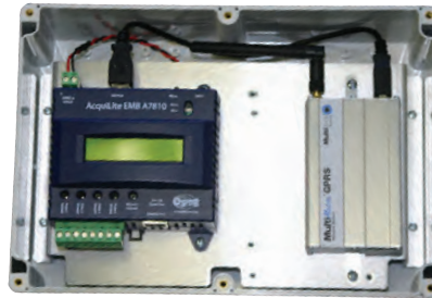
Acquisuite EMB (A7810)