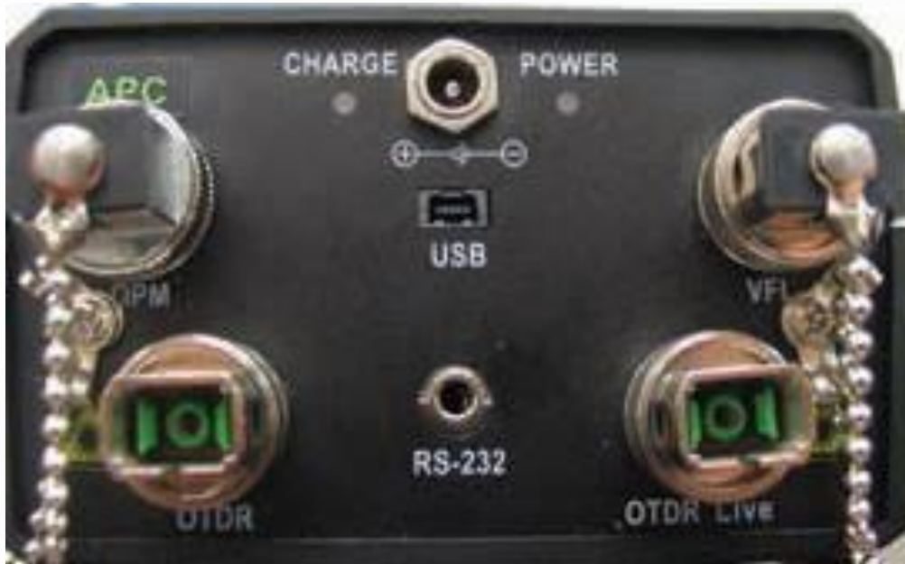
1310 and 1550nm Port

The 930XC-30F OTDR uses a 1625nm probe pulse to measure live or potentially live fiber optic networks. This is necessary so that network traffic is not disrupted during testing and troubleshooting processes.