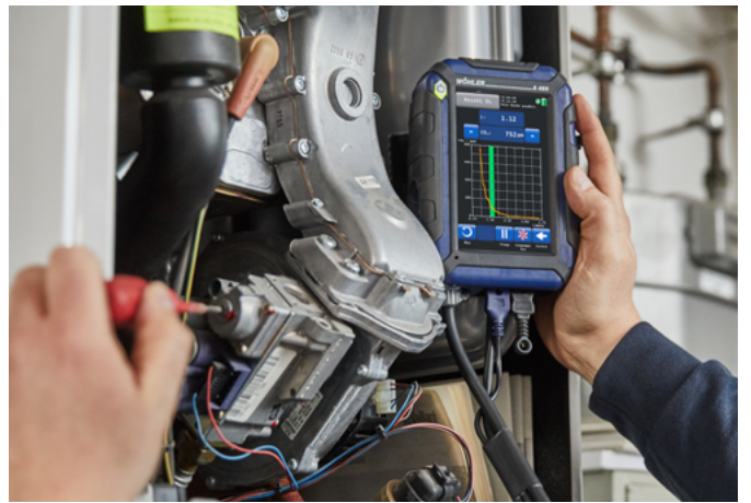
The tuning guide offers an advanced guidance to properly adjust the burner.