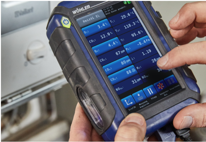
All measured values available at a glance with high-resolution display.