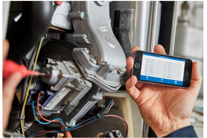
Wöhler A 450 app: Displaying the measured data on a mobile device.