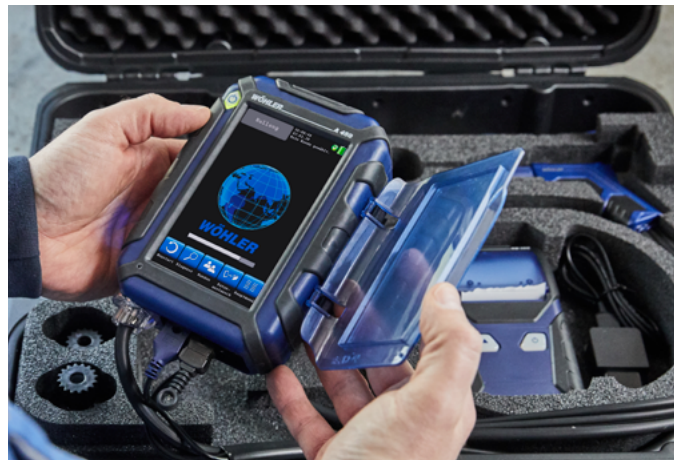
Sturdy and enclosed in a case.