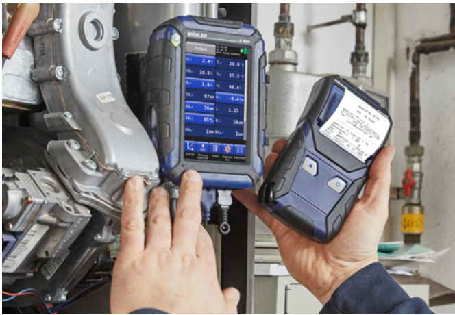
Printout of the measured data on site.