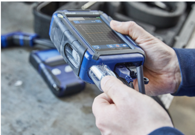
Easy access to condensate trap and filters.