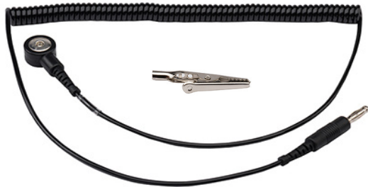
Product# 8107 6 per pack