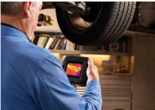
Ease of operation and ergonomic design make the T500 series an essential tool for product development and research