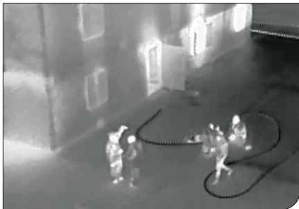
KF6 provides high angle thermal perspective.