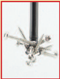
No. 70390 24" (610 mm)