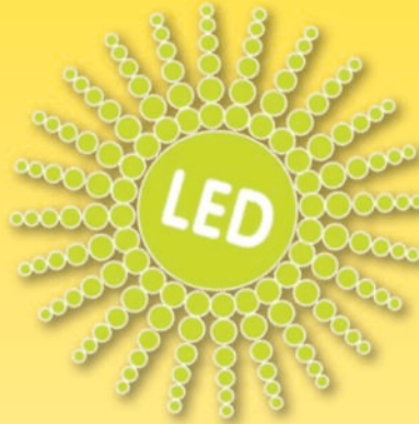
No. 70393 12" (305 mm)