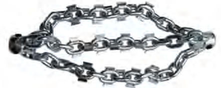
Carbide Tipped Chain Knockers