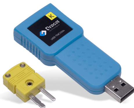
All types of converters are supplied with their respective connectors.