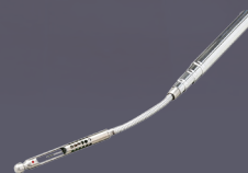
Telescopic, articulating probe