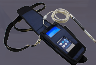
Hands-free Case now available!