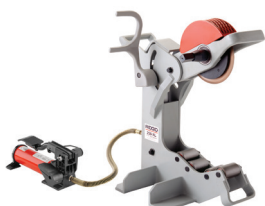
Model 258XL Power Pipe Cutter Catalog No. 58227