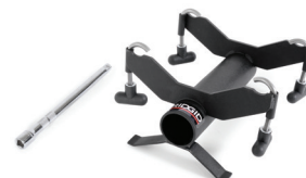
Catalog No. 55023