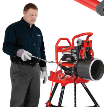
Beveller shown on TBM-36 Beveller Adapter (Cat. # 55023) for fixed bevelling.