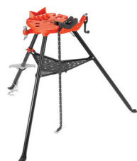
Model 460-12 Portable TRISTAND® Chain Vise Catalog No. 36278