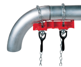
No. 463 Elbow Pipe Welding Vise Catalog No. 40230