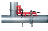
No. 462 Angle Pipe Welding Vise Catalog No. 40225