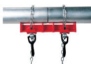
No. 461 Straight Pipe Welding Vise Catalog No. 40220