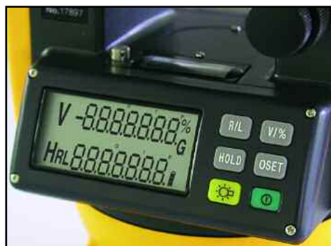
Easy-to-Read LCD Display

56-DGT10 Berger 10 second Digital Theodolite