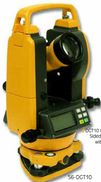
56-DGT10 DGT10 Units have Dual Sided LCD Displays with Controls

56-BDT30 Berger 30 second Digital Theodolite