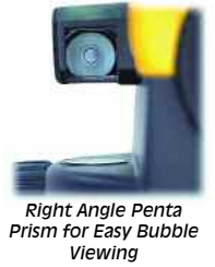
Right Angle Penta Prism for Easy Bubble Viewing