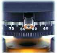
Compensator Lock Protects Instrument During Transport