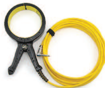
Inductive Signal Clamp: Compatible with all RIDGID transmitters