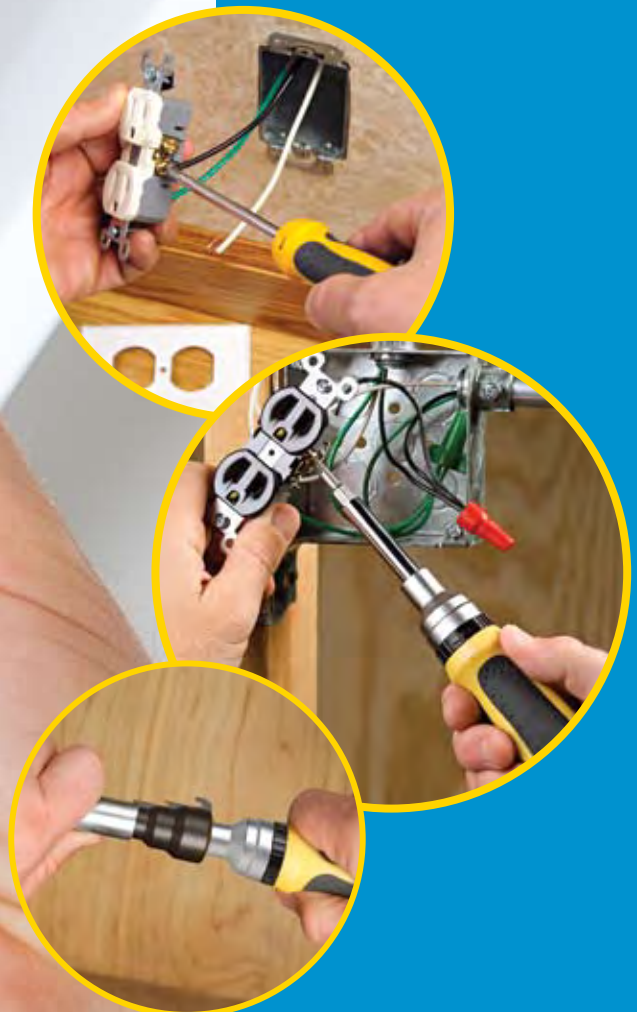
21-in-1 Twist-a-Nut™ Screwdriver