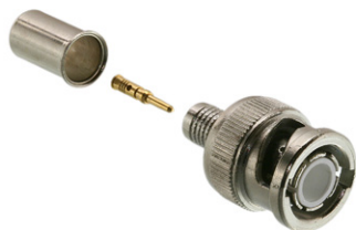
305-2TP BNC Male 3PC Crimp-Crimp, 50 Ohm