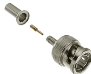
307-18TP BNC Male 3PC Crimp-Crimp, 75 Ohm