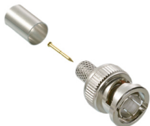
307-2TP BNC Male 3PC Crimp-Crimp, 75 Ohm