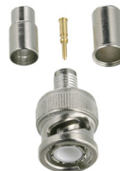
305-21TP BNC Male 3PC Crimp-Crimp, Double Ferrules, 50 Ohm